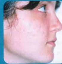
After 8 ClearLight treatments