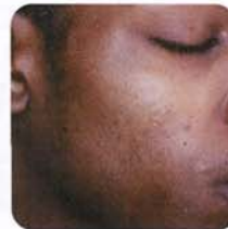
After 8 ClearLight treatments