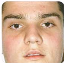
After 8 ClearLight treatments and 2 months of follow up